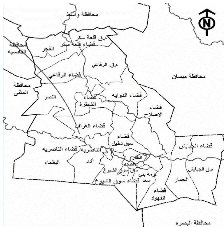
Fig(1): South of Thi-Qar Governorate, the points represent the sampling locations from the numbering at the station number (S)

As portrayed in Fig.1, the research was designed to evaluate the uranium hazard and compare its level specifically in collected soil samples of varying sites from southern Thi- Qar Governorate-Iraq.